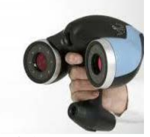
Fig 3. Laser scanner CREAFORM