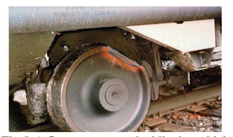
Fig 5. A flat spot occurred while the vehicle wheel set is dragging along the rail

Measuring can help to perform predictive maintenance and avoid typical faults as hot boxes, wheel flats [4], etc. (Fig.5, 6).