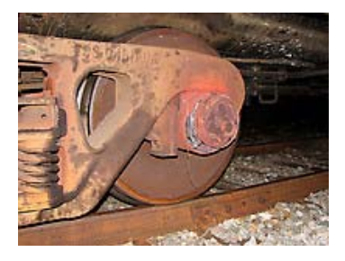
Fig 6. Overheated railway vehicle axle box (Hotbox)