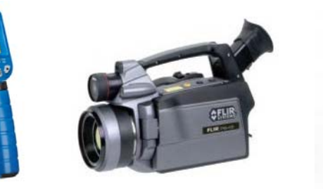
Fig 1. Infrared thermograph